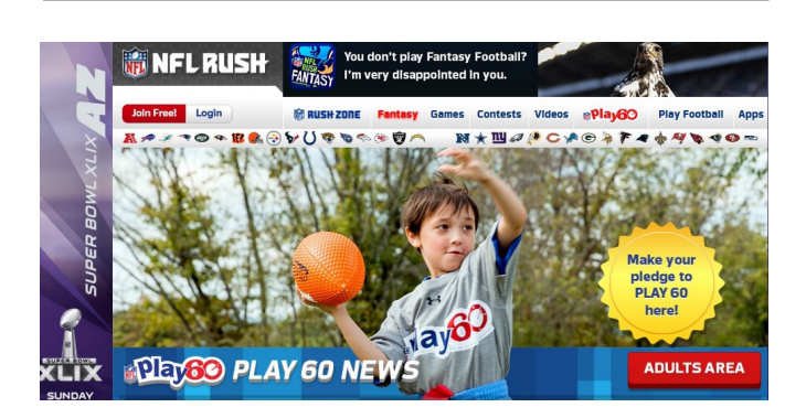
Fantasy football, videogames, and NFL broadcasts are promoted throughout the Play60 website.

Perhaps even more concerning is that NFL Play 60 promotes sedentary play that is at cross-purposes with