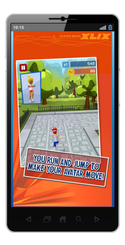
The Play 60 app can be played successfully without ever running, jumping, or taking a single step.

a physical activity campaign. NFL Play 60 is housed at NFLRUSH. Far from being an online site dedicated to encouraging exercise, the website is dominated by sedentary screen activities such as online games, apps, and fantasy football, as well as links to game footage and player profiles, advertisements for its Nicktoons television show, and football telecasts. Play 60 has also partnered with XBOX and its gaming systems have been distributed as prizes to schools that participate in the NFL Play 60 Challenge.<sup>24</sup>