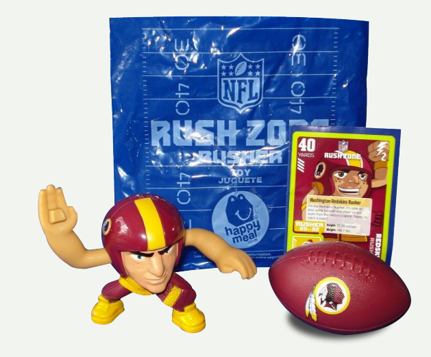
NFL Rush Zone "Redskins Rusher" Happy Meal Toy.

Similarly, partnering with or promoting the NFL makes nonprofits and educators complicit in promoting racism to children. YMI's NFL Rush Zone educational materials include references to "Redskins," as do the American